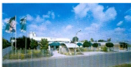
Silikal production and administration in Mainhausen, Germany.

All details given above can only serve as general information. The various working conditions or circumstances beyond our control and the many different materials in use exclude any claim which might arise out of the information contained herein. In case of doubt, we recommend that you make sufficient trials on your own.