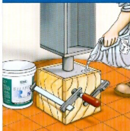
Anchoring machinery and steel structures