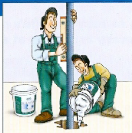
Anchoring heavy-weight profiles and components