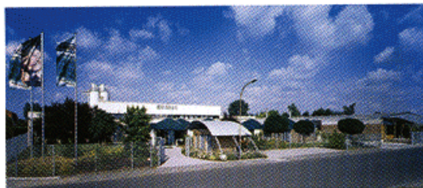
Silikal production and administration in Mainhausen, Germany.