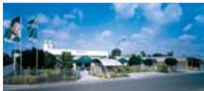
Silikal production and administration in Mainhausen, Germany.