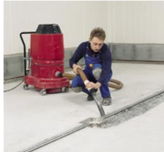
Vacuuming up dust and dirt