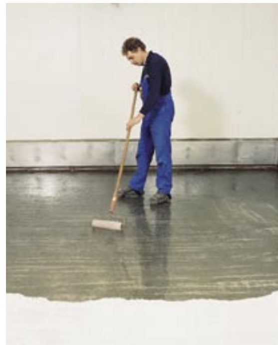
Priming with Silikal