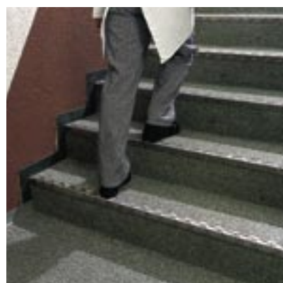
Steps in a catering trade