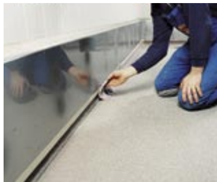
Covings with Silikal