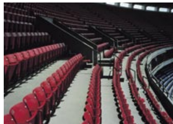
Riverside Stadium, Middlesbrough, England