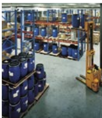
Storing barrels in the chemical industry