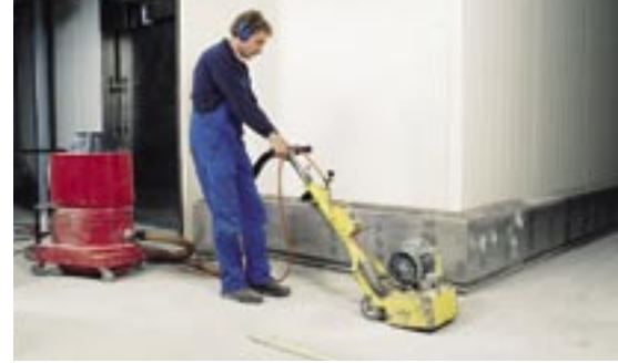
Sanding down the old floor

Millions of square meters of Silikal® reactive resins have seen action in use in Germany, throughout Europe and in many countries around the world over the past decades. They can be found on heavy-duty floors throughout practically every branch of industry from supermarkets to automobile assembly lines, from heavy industry to precision mechanics and pharmaceutical labs, from small workshops to huge food processing plants such as slaughterhouses, dairies, winemakers and beverage producers. But that is not all. They have also been used at boutiques, shops and stores, on loading ramps, at TV and radio studios as well as in sports arenas and stadiums. Convinced? Then give us a call. We'd be happy to give you more details!