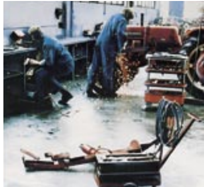
Tractor repair shop