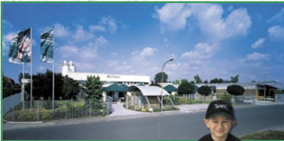
Silikal production and administration in Mainhausen, near Frankfurt/Main, Germany.